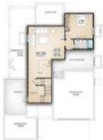
Optional Basement Finish