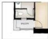
Optional Master Deck