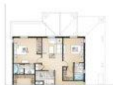
Optional Bedroom Suites